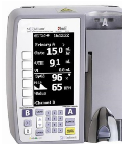
MRidium® 3860+ IV Pump

The number of sessions is dependent on the departments and staff to be trained. 'General Sessions' are typically larger groups of clinicians from those patient care units which will interface on a regular basis with the MRidium IV pump. Classroom times generally run up to 30 minutes depending on the size of the class.