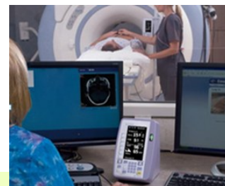
MRidium® 3865 Remote